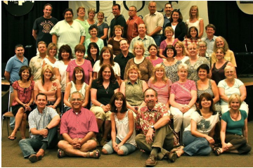
“Effective Prayer: Power for Change” seminar July 10th at New Harvest Church in Clovis

87% of participants rated this course “very good” or “exceptional”